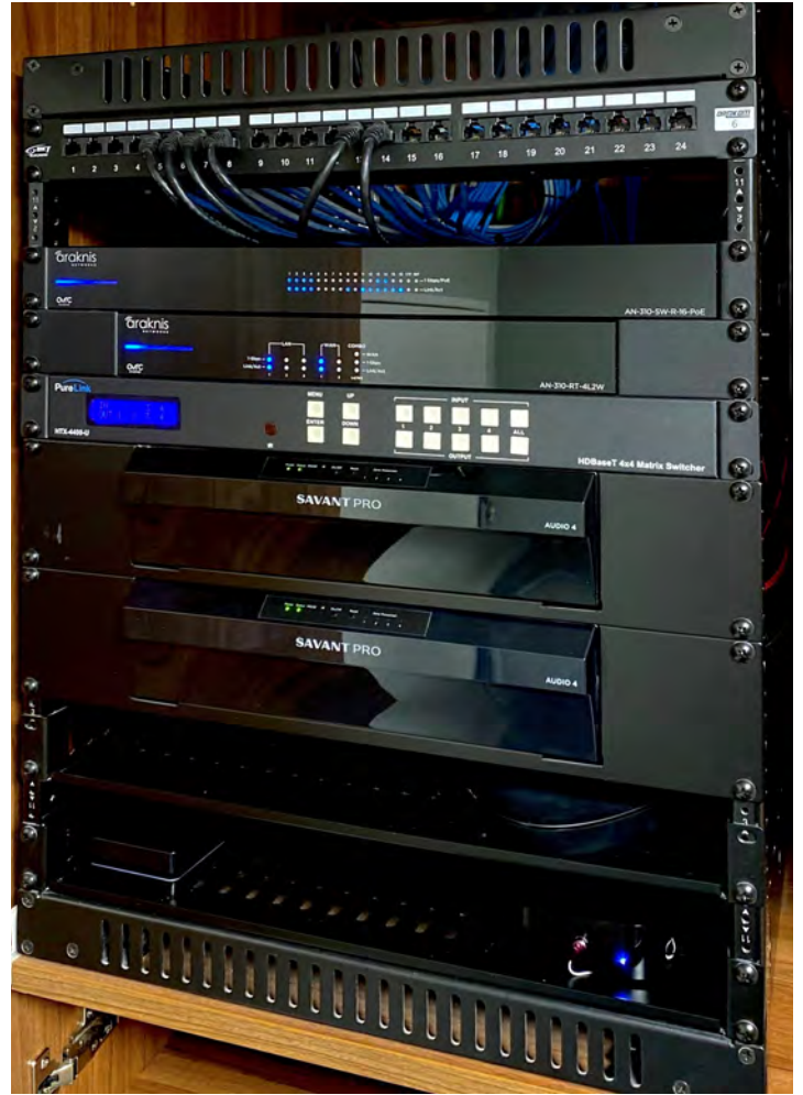
The smart home equipment rack tucked out of sight in the laundry room

TSP's Icelandic subsidiary, called Nordic Smart Spaces, is located in Reykjavik and able to provide first class service to the 71 Austurhöfn residences. This localized service capability is ideal for efficiently responding to requests for new features or any other required maintenance. TSP is also quite adept at remote management, making firmware updates and other requests easy to address by simply connecting remotely to the system using Savant's cloud-based Central Management solution, engineered to securely streamline remote service by integrators while facilitating rapid response times, keeping all of the residents smiling.