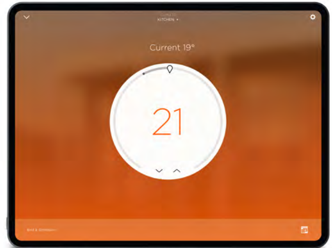
Intuitive climate control from the Savant Pro App

The smart home hardware, including the Savant Host (the hub for the smart home system), fits neatly into a small equipment rack located in the laundry room of each Austurhöfn apartment. In Iceland, it is standard code for residential wiring to be enclosed within PVC tubing. Oh explained that