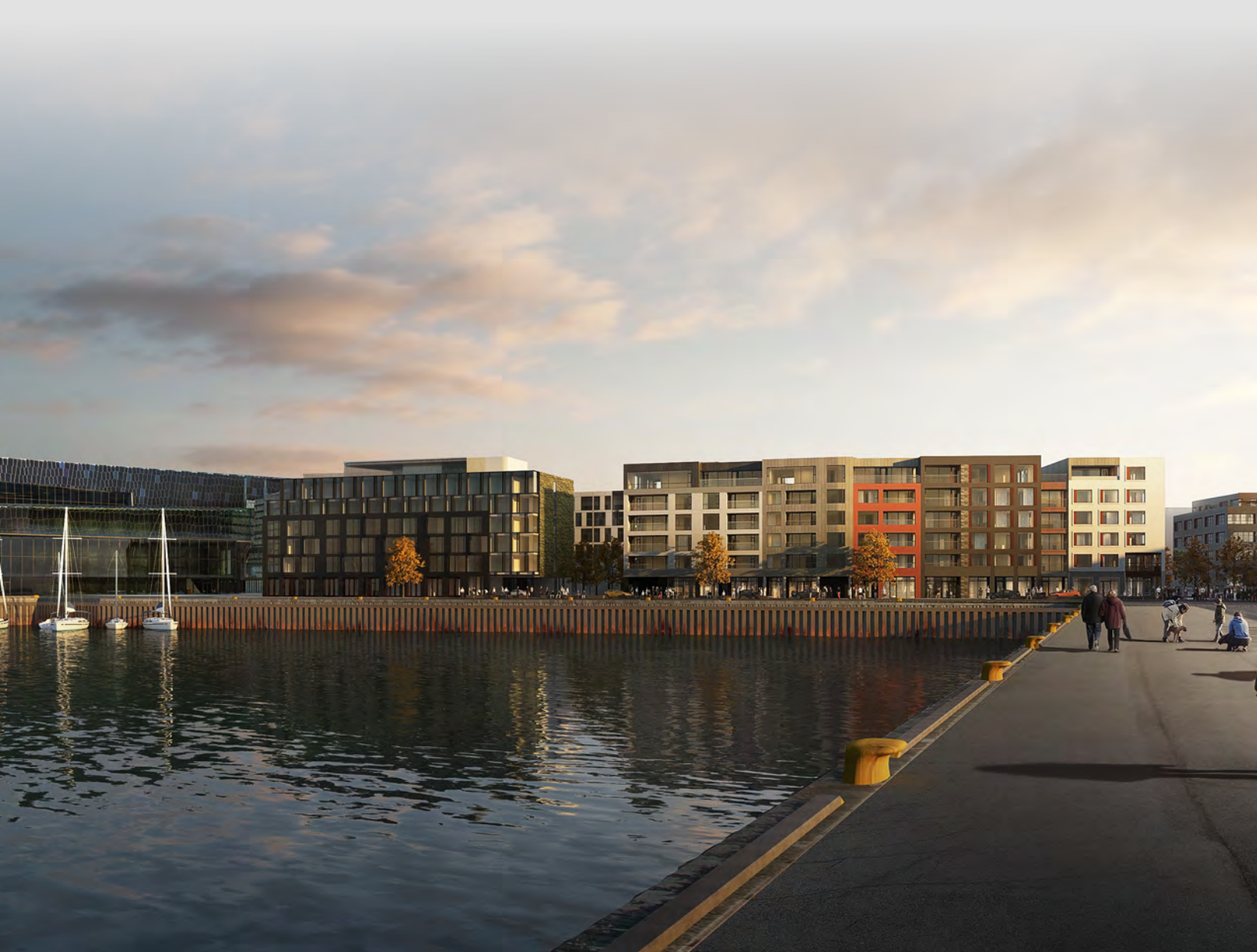
The Austurhöfn apartment complex located on the water in Reykjavik, Iceland

WIRC Media PR contact: Micah Sheveloff (727) 258-4770 wirc1@wircmedia.com