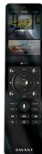
The Savant Pro Remote

X2 features an all-aluminum chassis available in three finishes, sleek, easy-to-press backlit buttons and a 3.1-inch high-resolution glass touch screen.