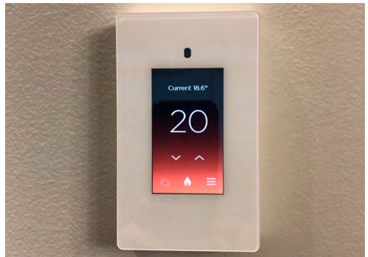
The Savant Smart Multistat

the presence of these wiring channels makes it easy to accommodate changes and upgrades for each resident. Leveraging the scalability of the Savant smart home ecosystem, the TSP team created a base package for Austurhöfn home owners that included the Savant Pro Host and a Savant Smart Multistat Wi-Fi-enabled thermostat, providing lighting and environmental control as well as remote door entry control accessible via the Savant Pro App for iOS or Android devices. Utilizing the Savant Pro App, residents have access to change the temperature, create HVAC schedules and even remotely adjust their thermostat to raise the temperature on their way home from work, arriving to an apartment that is toasty warm while maintaining energy efficiency throughout the day.