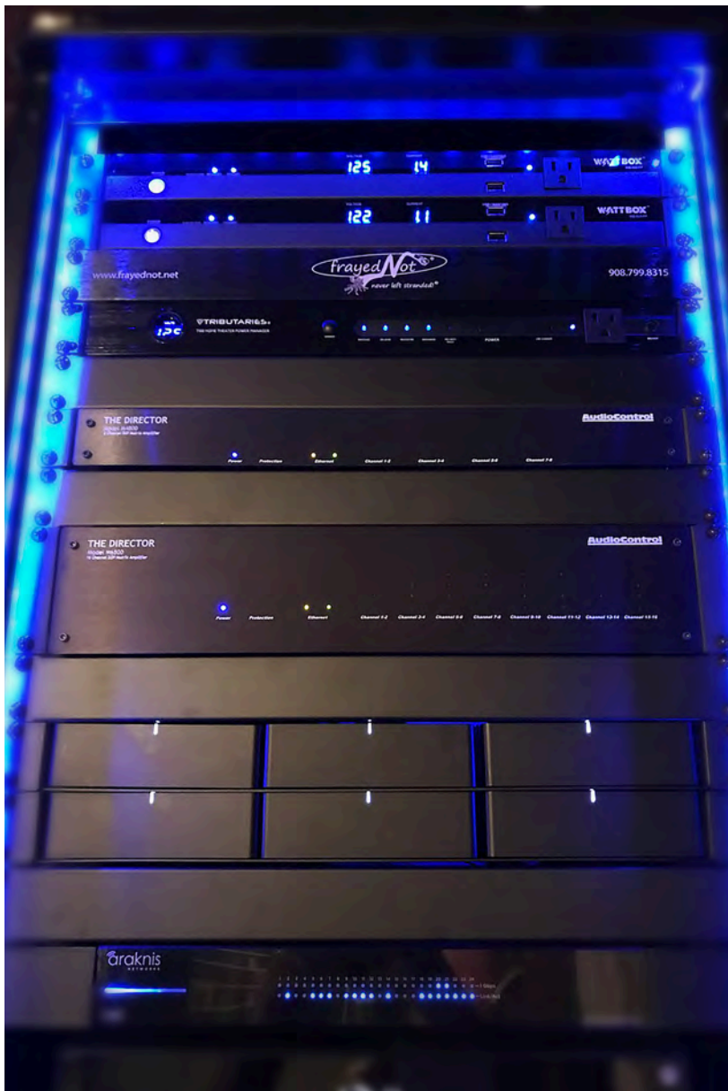
The frayednot—never left stranded® equipment rack front view