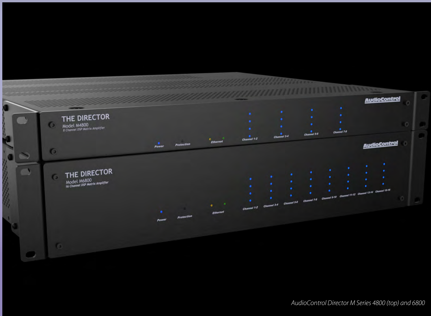
AudioControl Director M Series 4800 (top) and 6800