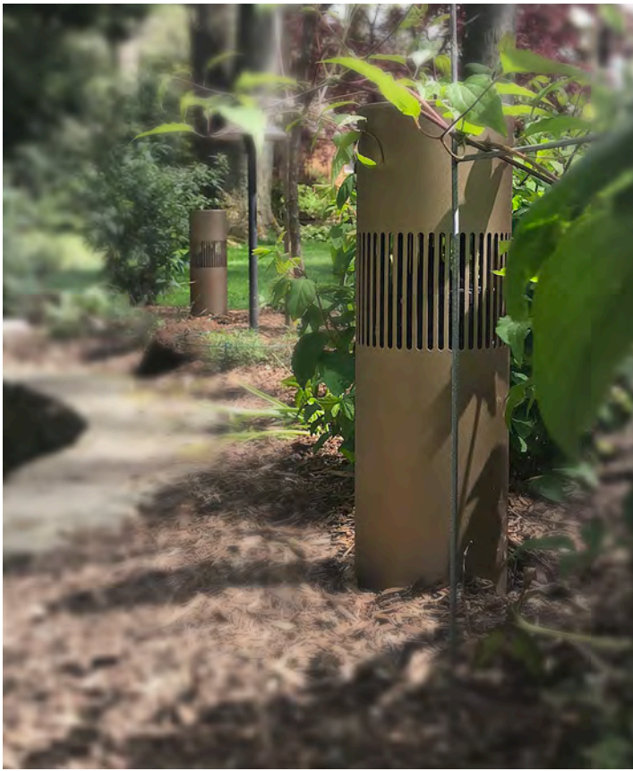
Landscape loudspeakers evenly present beautiful sound throughout the area