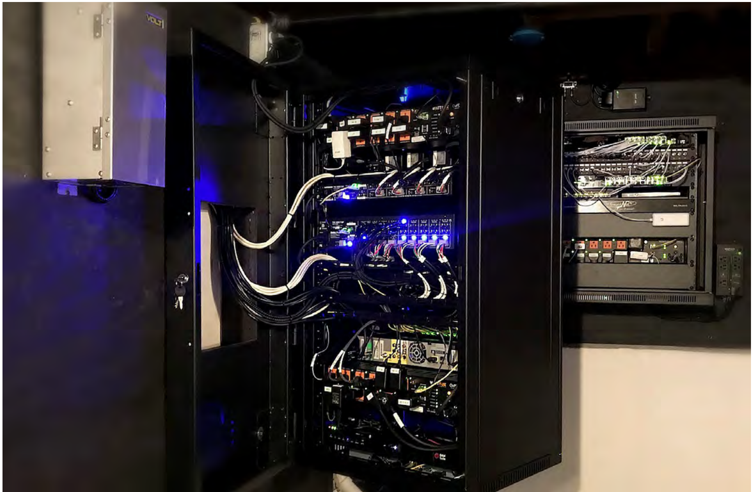
Access to the backside of the neatly adorned equipment rack