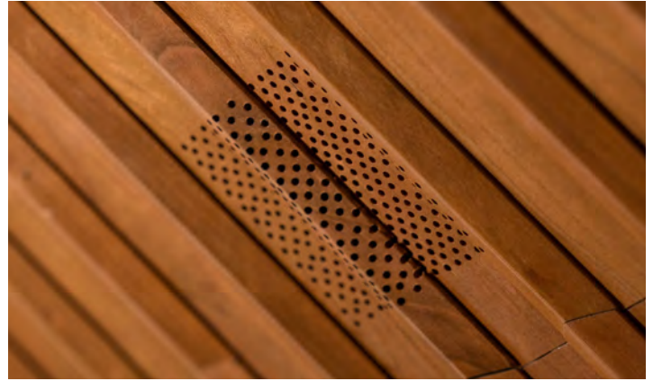
The local woodworker perforated the beautiful hardwood panels, allowing sound into the space

Loudspeaker provides grille-matching customization services like this, the woodworker onsite was able to carefully perforate the boards in just the right places to accommodate the sound system. The result was sonic nirvana from a barely visible opening.