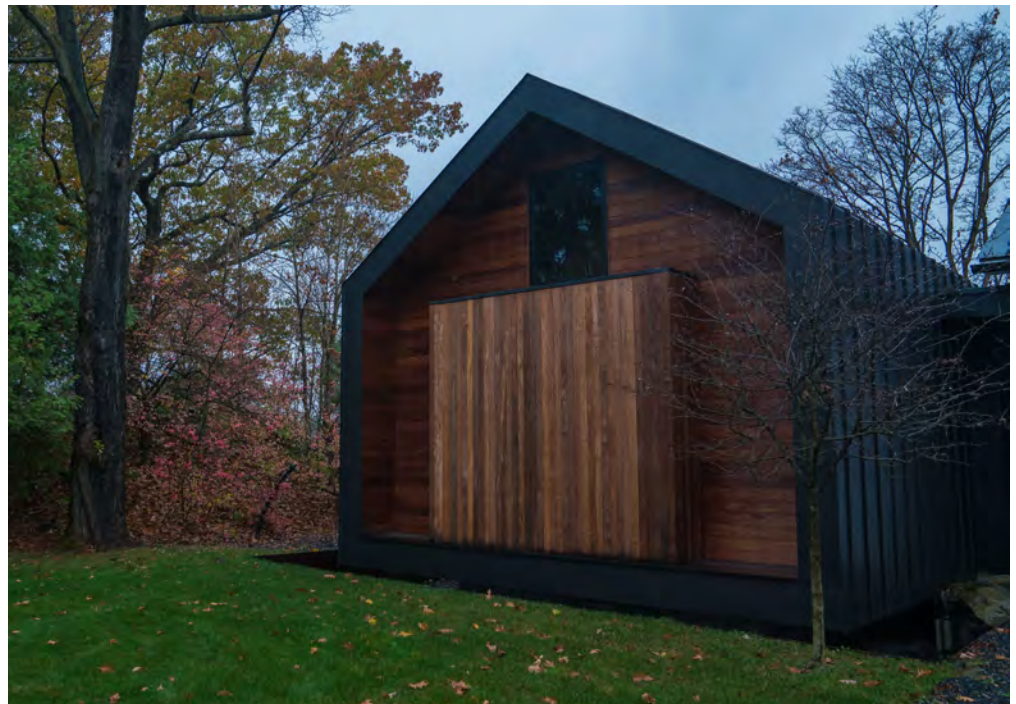
Upstate New York barn with views of the Hudson River

The T1V collaboration software supports BYOD™ (bring your own device) to support the many devices, programs, and platforms of today's meeting and learning environments. The high-tech multi-touch, multi-user screen enables the client to collaborate with teams all over the world. The Planar screen is not currently connected to the entertainment system per the client's request; however the Gilmore team addressed such a possibility in their prewire. "We are prepared for that should he request connectivity down the road," said Gilmore.