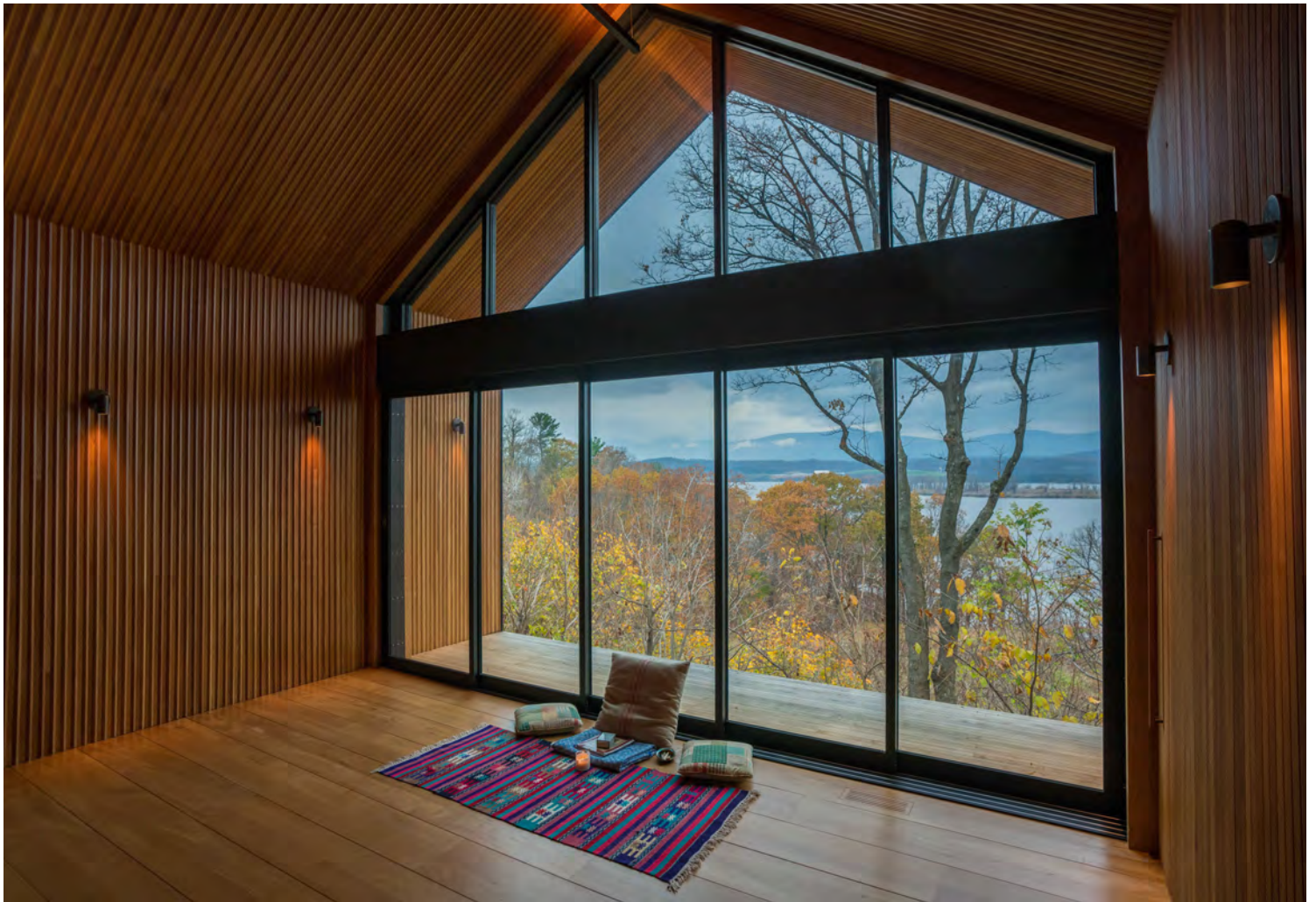
Beautiful views of the Hudson River enjoyed from the yoga studio