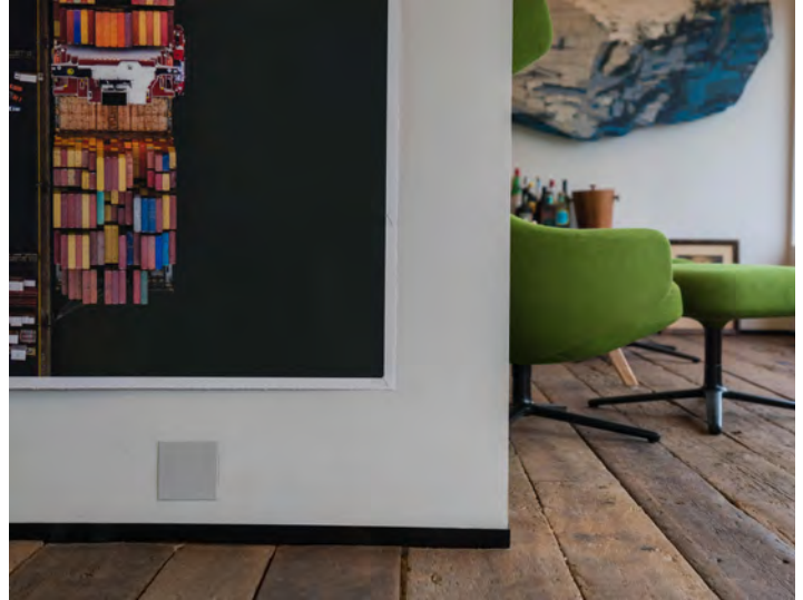
Barely visible—James Loudspeaker Small Aperture grilles