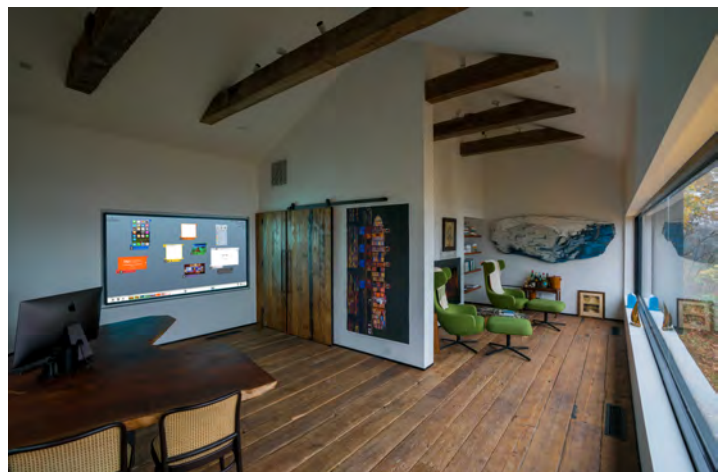
The open space designed for work and peaceful reflection

experience to enjoy TIDAL and other streaming content along with an array of favorite podcasts.