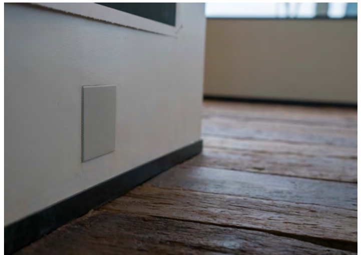
Barely visible—James Loudspeaker Small Aperture grilles

Because this client desired audiophile quality driving bass response in this environment, the Gilmore team integrated a single 101SA-6 subwoofer behind the wallboard in each zone. The 101SA-6 features an all-aluminum bandpass enclosure housing a 10-inch woofer mated to an elegant, compact 4-inch grille. Each subwoofer is driven by a James Loudspeaker M1000 amplifier nestled in a rack within the concealed, dedicated and air-cooled equipment space next to the yoga studio. The rack also contains the networking hardware, streaming music servers and multi-channel amplifiers for the entire system.