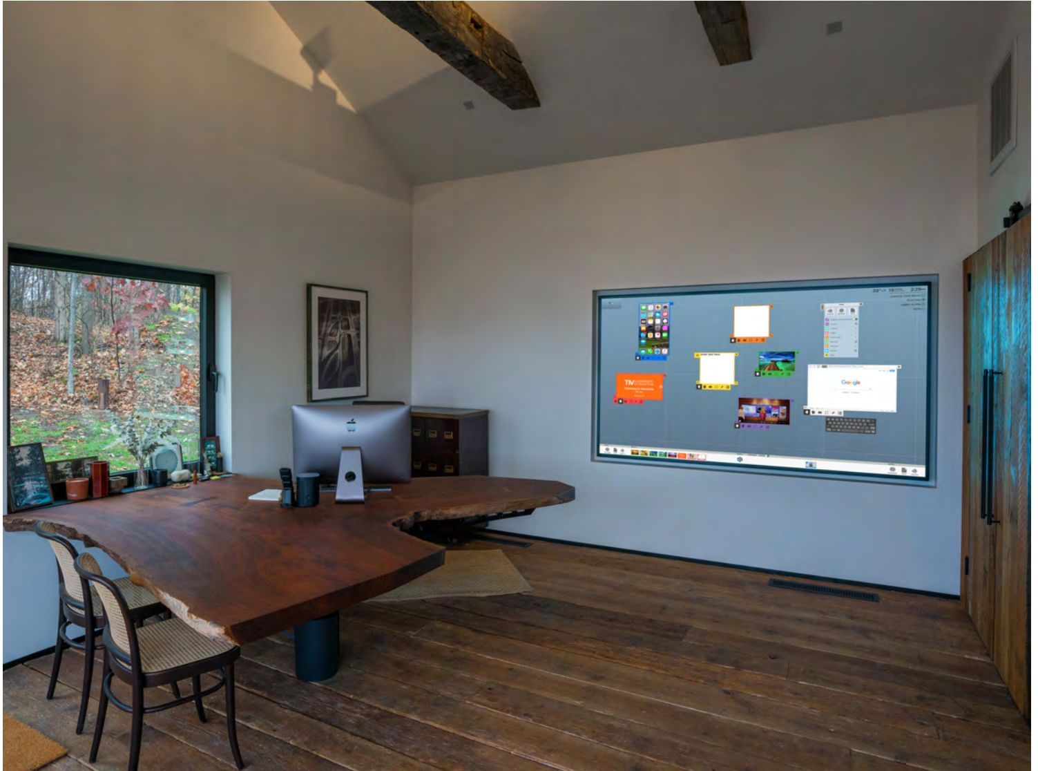
The 98-inch Planar TV highlights the office with James Loudspeaker Small Aperture speakers above nestled in the ceiling