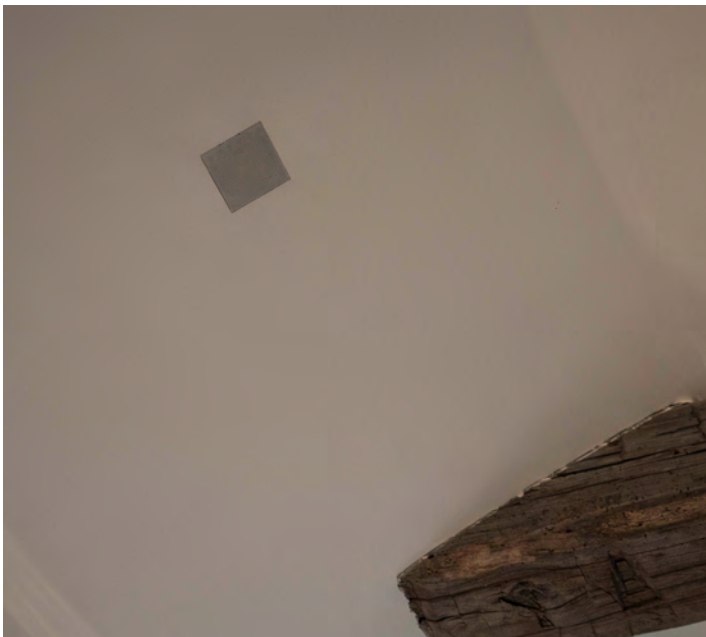
Barely visible—James Loudspeaker Small Aperture grilles

There are three primary zones of entertainment within the renovated barn; the yoga room, the office and a sitting area. There is also music available in the steam room as well. In order to achieve the output levels, detail and balance that the client desired, the team from Gilmore deployed James Loudspeaker 63SA-7HO Small Aperture® architectural speakers (two pair in the office, two pair in the yoga studio and a single pair in the sitting room) and a 101SA-6 Small Aperture architectural subwoofer in each zone. The award-winning 63SA-7HO is a true full range, 3-way design with a 0.75-inch (19mm) aluminum dome tweeter, 2-inch (50mm) aluminum midrange driver and a 6.5-inch (165mm) aluminum woofer, all concentrically mounted within an aircraft-grade aluminum enclosure. Inherently durable and designed for multi-zone audio installations, the 63SA-7HO is especially suited for premium installations where critical listening is paramount and aesthetics are equally as vital. The point source mid/high module provides excellent off-axis response and the overload-protected hidden woofer generates bass down to 38Hz for a truly full-range music experience—and all from a beautiful 3-inch round or square Microperf grille.