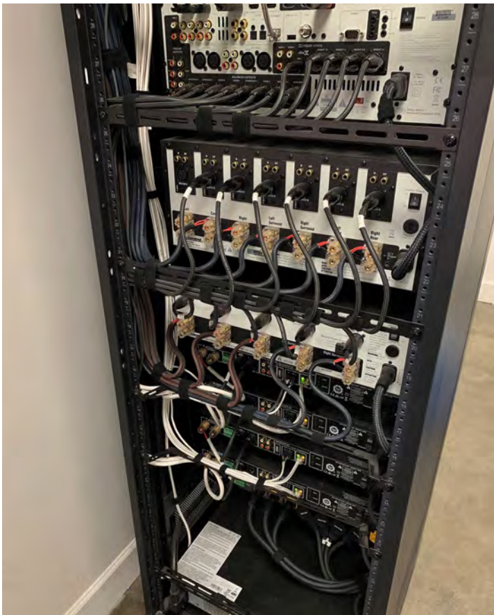
Rear view of equipment rack highlights exceptional workmanship

The award-winning AudioControl Maestro M9 4K 7.1.4 preamp/processor is a highly sophisticated component offering IMAX® Enhanced capability, enabling consumers to experience the IMAX signature sound mix, delivered by DTS, with the power and grace of AudioControl's remarkable line of home cinema products. The M9 supports Dolby Atmos® and DTS:X™ surround formats, and features Dirac Live® room correction technology to perfectly match the acoustics of any space. The M9 also delivers the latest high-resolution formats, including 4K Ultra HD (HDMI 2.0a / HDCP 2.2) with Dolby Vision™ and HDR playback support. Behind the exclusive, contemporary design of the Maestro M9 is a dynamic A/V processor featuring discrete Burr Brown DACs and the very best in video processing and upscaling. This processor was engineered to deliver unmatched cinematic excitement in any room, complementing today's astonishing movie soundtracks as the artist or director intended.