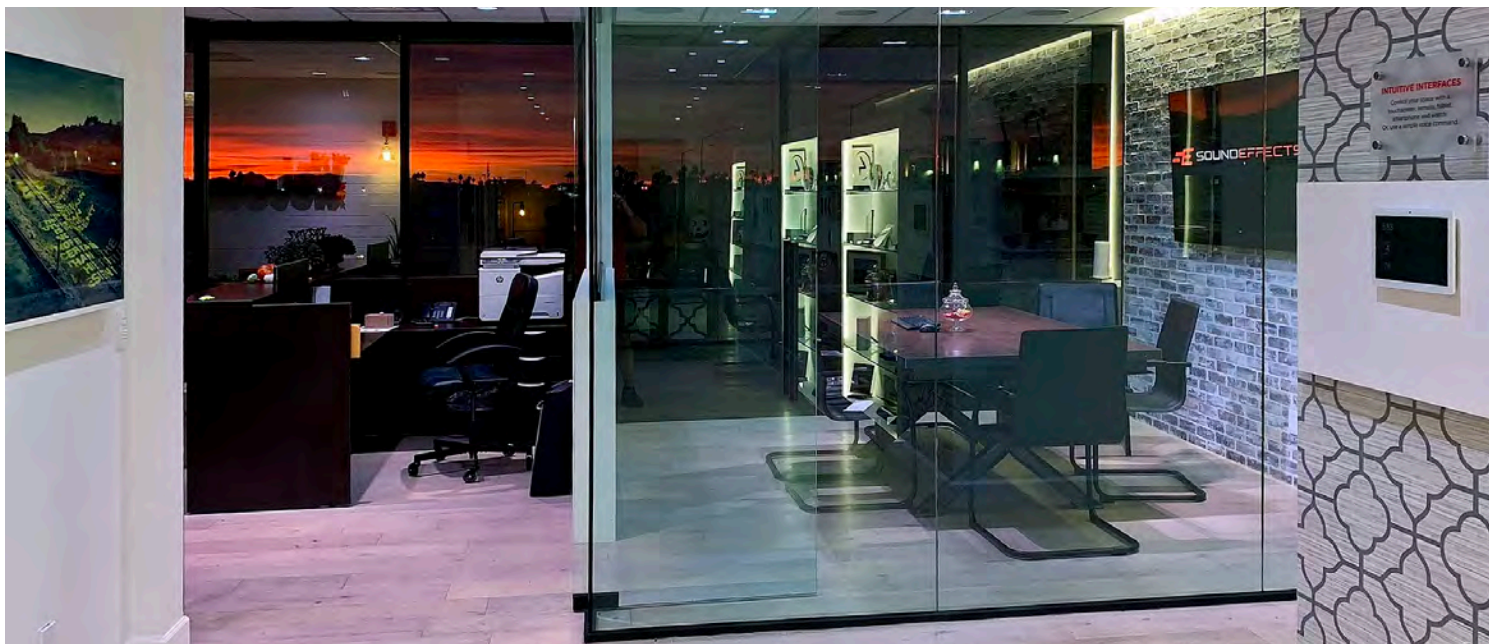
The sunset glows behind the beautifully renovated Sound Effects showroom