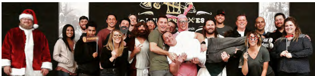
The Sound Effects team

circuitry controllable via discrete IR or discrete RS232 commands. The Bijou 600 is the ultimate single-zone solution and provides integrators with a combination of superb performance and important features.