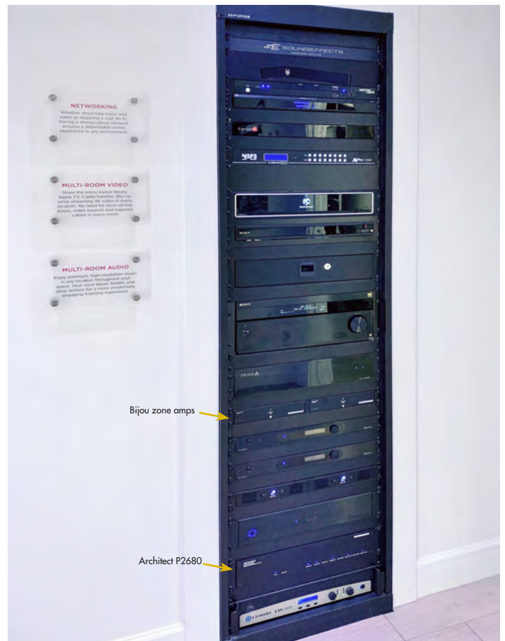
AudioControl Architect and Bijou amplifiers housed in a separate rack for the whole-house entertainment system