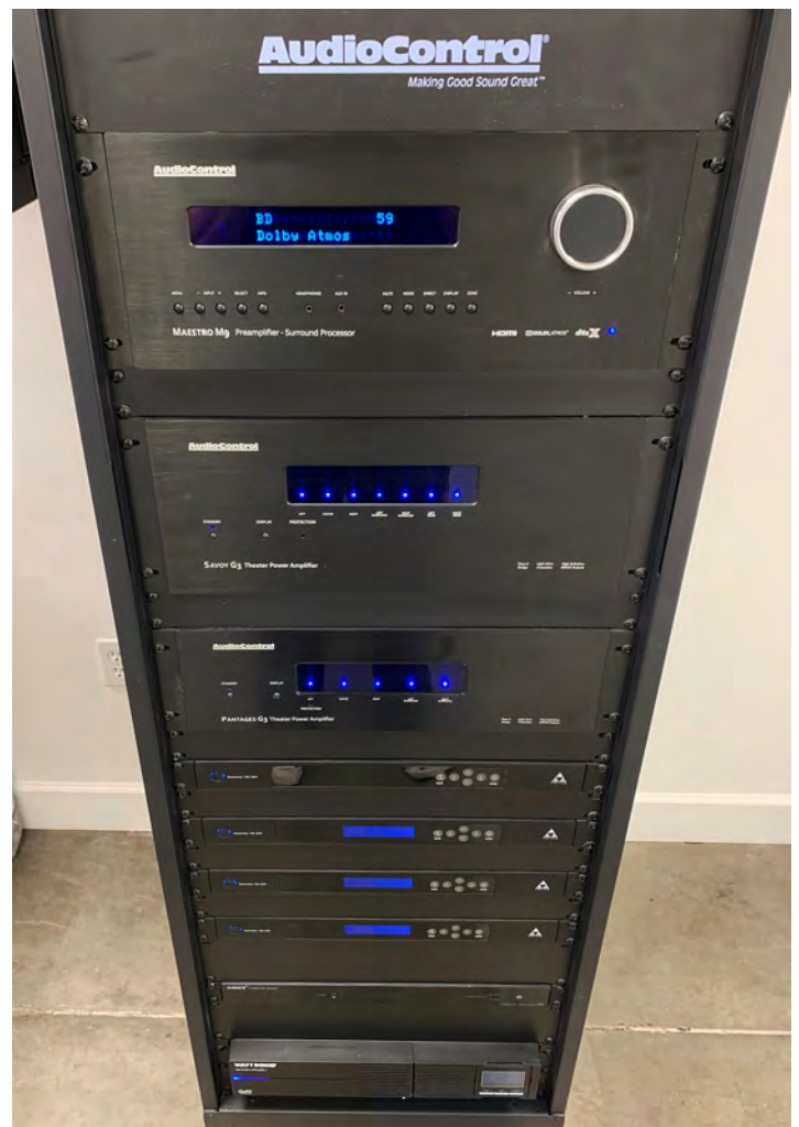
Front view of the equipment rack housing the AudioControl M9 processor and theater amplifiers