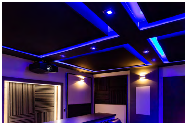
The Sound Effects theater rear view