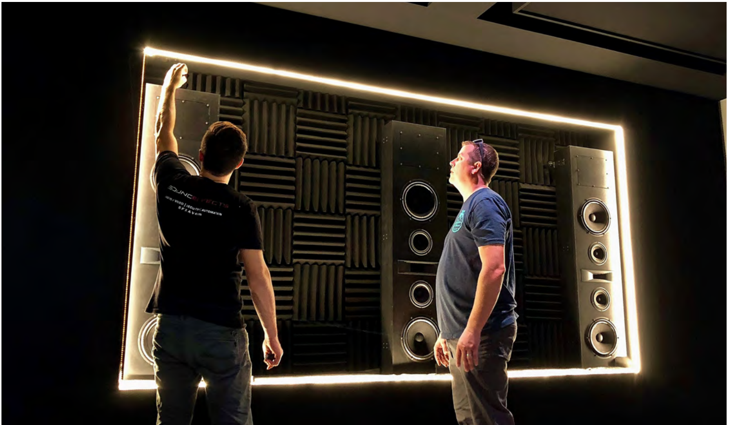
The front stage LCR loudspeaker system in the Sound Effects theater