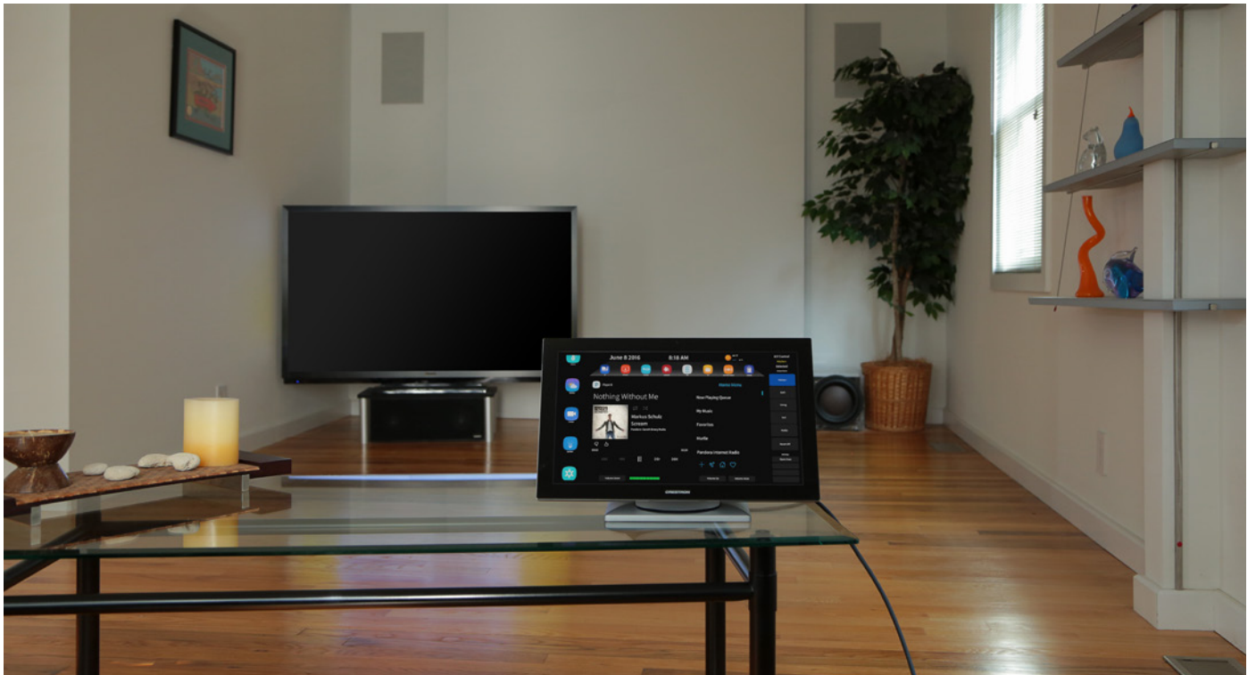
Crestron control throughout the home at Integrated Concepts, including this tabletop touchpanel.

“We show clients everything here—from advanced integrated security options, the quietest motorized window treatments, home automation and the Autonomic-based, whole-house entertainment. The customer can experience these technologies in a way that is conducive to envisioning them as part of daily life. That is the purpose of creating a show home.”