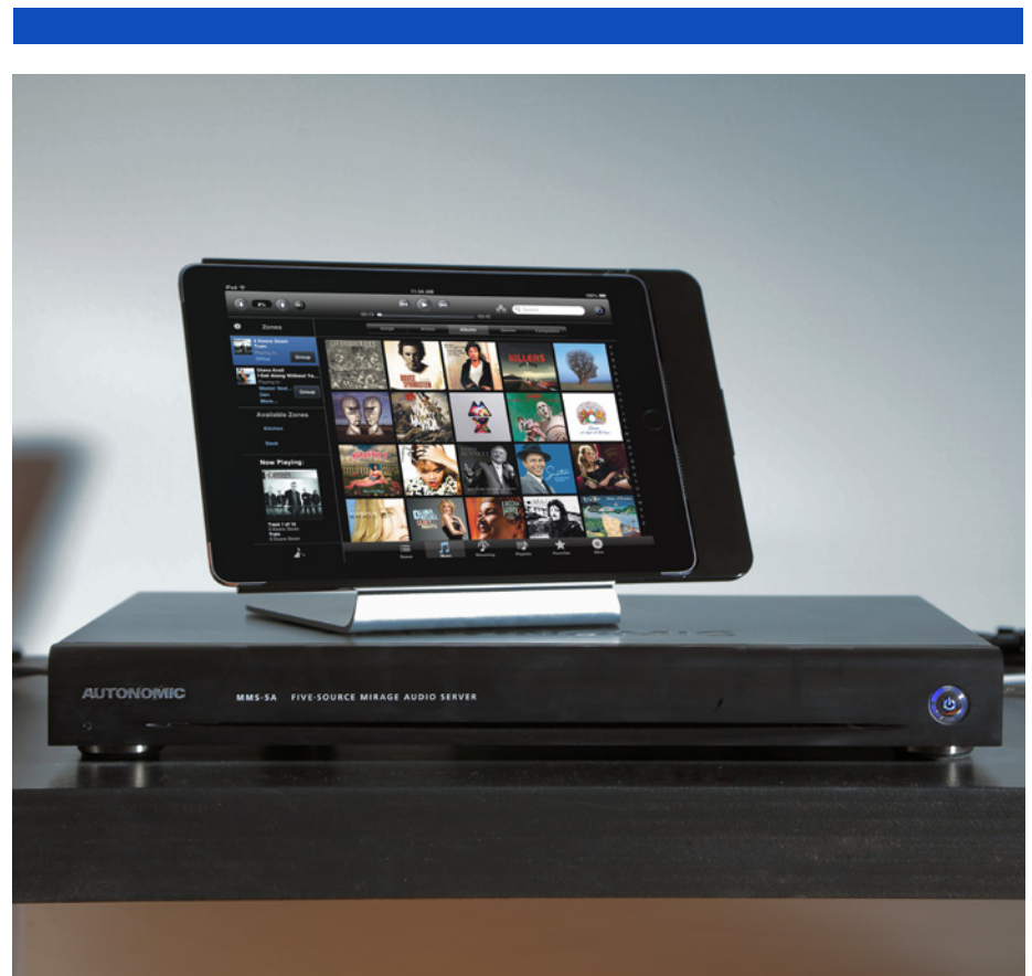
The Autonomic MMS-5A with iPad interface at Integrated Concepts.

Another innovation from Autonomic that Babcock leverages is the TuneBridge® feature, which enables users to map content by genre, artist or song type when they hear something they like at the touch of a button. "TuneBridge is brilliant; however, I typically bring my customers along slowly, and let them get