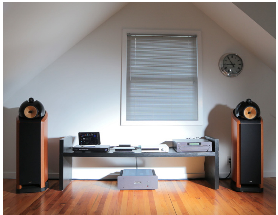
The upstairs listening space at the Integrated Concepts Show Home featuring an Autonomic MMS-5A and high-performance entertainment system.