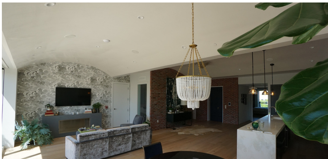
BBD Lifestyle 3rd floor showroom

also seamlessly controls the audio, video and security cameras throughout the facility. The store lighting scenes for opening, hours of operation and closing are all automated to perfect brightness by the Savant control ecosystem. In addition to the street level retail space, BBD Lifestyle maintains a chic home automation showroom on the third floor, also fully outfitted with Savant to provide a more in-depth smart home experience for prospective clients.