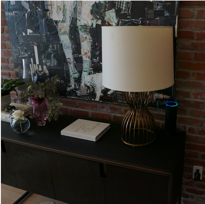
Savant's interface with Amazon Alexa in action

The 3rd floor showroom was constructed to look like a luxury residence and features a wall-mounted iPad conveniently located as you enter the space from the elevator. The iPad and other iOS devices run the Savant Pro App, the most intuitive user interface for effortless, single-app control of multiple smart home devices. The upstairs area also features the highly intuitive Savant Pro Remotes, enabling users to easily control various smart home appliances such as motorized window treatments, lighting, climate control, security cameras and whole-house entertainment. The Savant Pro Remote with Alexa integration enable the BBD team to effortlessly