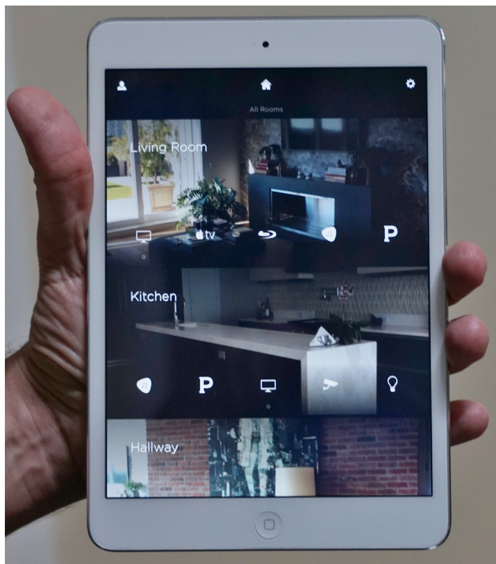
Security camera views, Savant Pro App

BBD Lifestyle succeeds in differentiating themselves from competitors by offering the best solutions such as Savant combined with expert design and integration services. "Savant enables me to provide my clients with easy access to all of their smart home functionality—from lighting and climate control to entertainment and security—all from one intuitive interface that can be comfortably operated by anyone in the home. Now that is enhanced lifestyle."