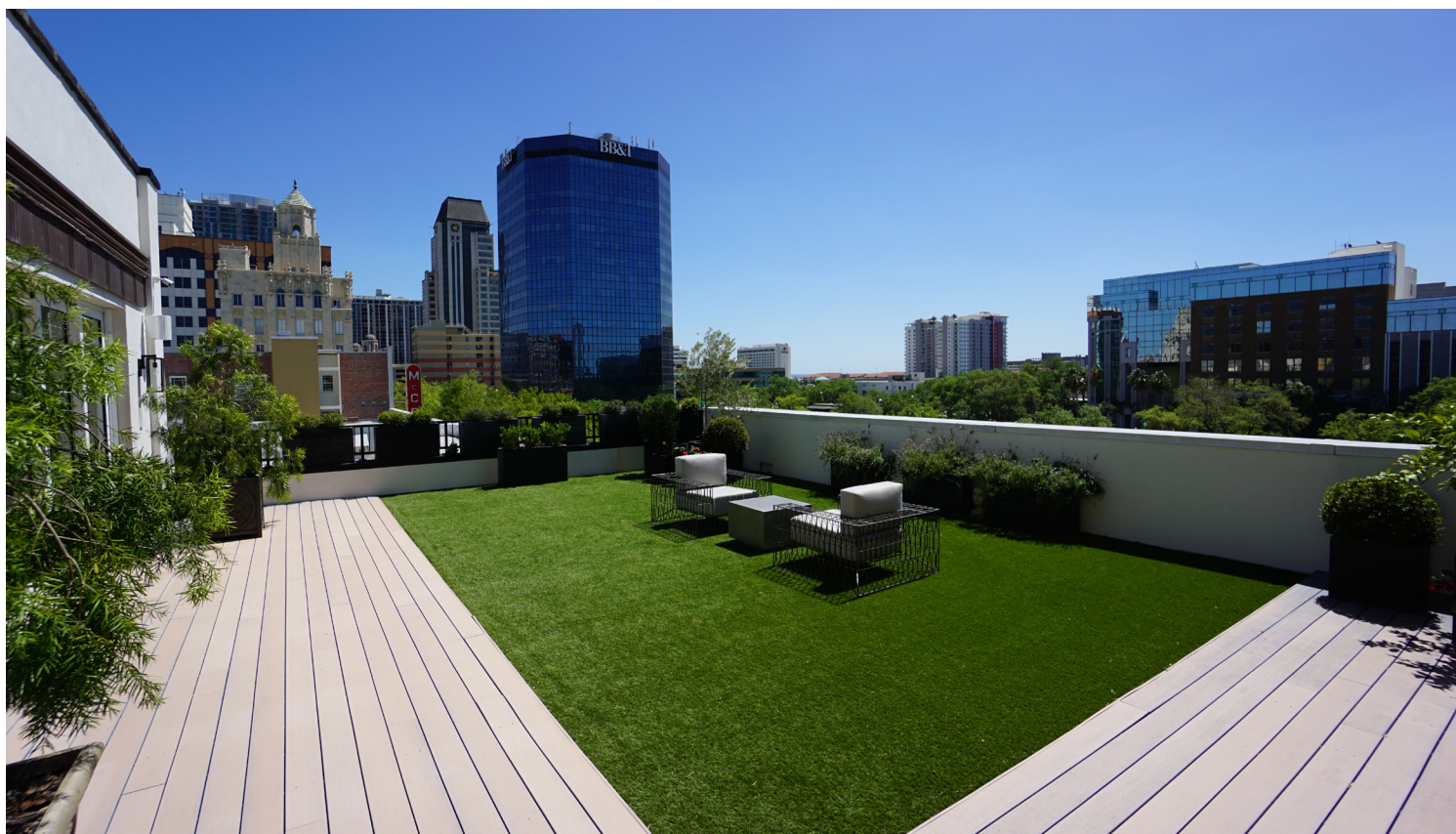
Outdoor seating area with views of Saint Pete skyline