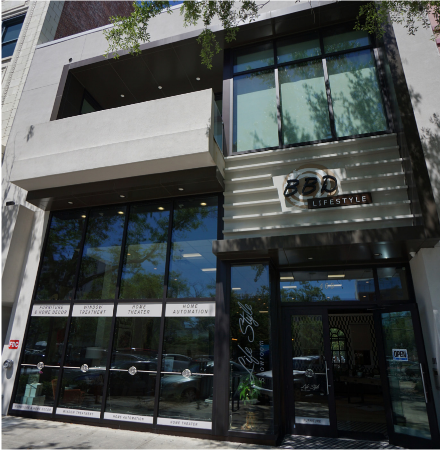
BBD Lifestyle storefront, Saint Petersburg, FL