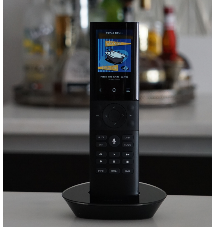
The Savant Pro Remote

demo voice control as part of the smart lifestyle, and award-winning Savant Scenes showcase the convenience of instant access to your favorite preset scenes accessible at the touch of a button on the Pro Remote. As an example, The "PARTY" scene activates appropriate mood lighting and entertainment content as well as video tiling, giving residents the ability to keep an eye on any combination of security cameras throughout the BBD Lifestyle showroom and elsewhere on