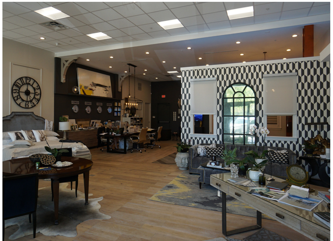
Warm and inviting BBD Lifestyle showroom

Located on Central Avenue in bustling downtown Saint Petersburg, The BBD Lifestyle showroom features an elegant display of home furnishings, beautiful fabrics and luxurious window treatments mixed with advanced technologies in a warm, well-lit and inviting setting. This is a far cry from your typical technology showroom adorned with walls of TVs and racks of audio gear...this place feels like home. Jay does make use of a flat panel display in the front window