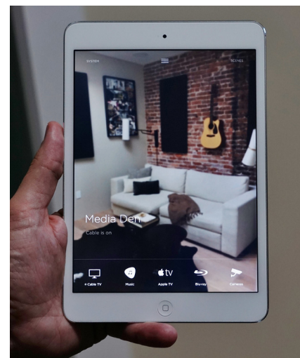
Entertainment screen, Savant Pro App