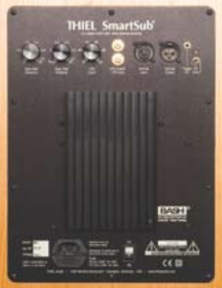
These listings are based on the manufacturer's stated specs; the HT Labs box below indicates the gear's performance on our test bench.